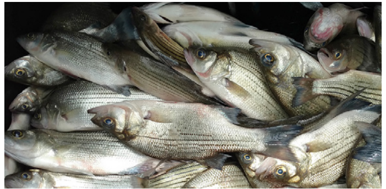
Another nice mess