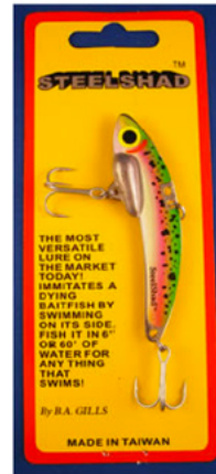
SteelShad blade baits have been big producers!

The whitebass run is on!! SteelShad bladebaits have been great using a yo-yo style of fishing. Check them out online at www.steelshad.com , or at your favorite bait and tackle shop. Let them sink to the bottom and steadily pull up about 6 feet. Pause there and then tightline the lure back to the bottom. Repeat back to the boat. On sunny days we use the silver colored baits and on cloudy days we have used the gold blades. Somedays we have been using 3/8 ounce inline spinners in white with a silver blade. Hit bottom then reel at a medium retrieve about 8 times around. Then open the bail and let the lure sink back to bottom. Repeat back to the boat. Jigging spoons have worked some also.